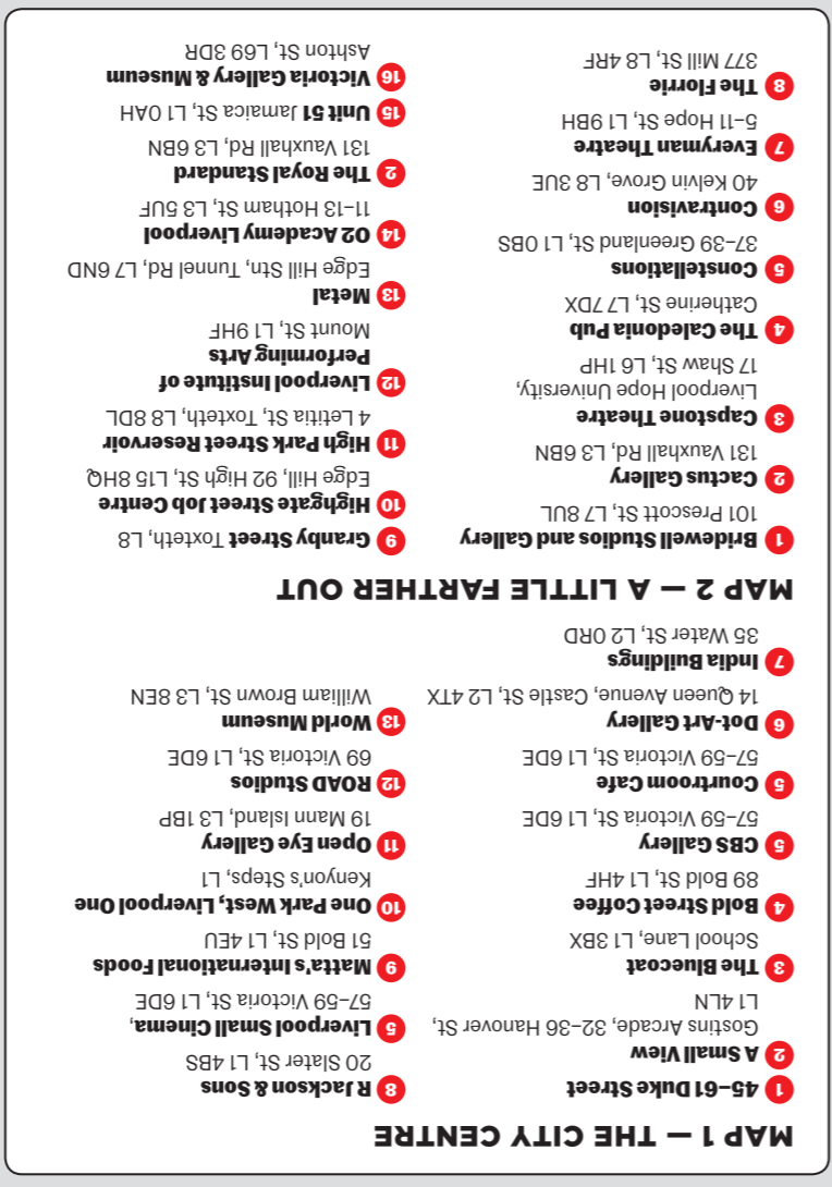
MAP 2 – A LITTLE FARTHER OUT