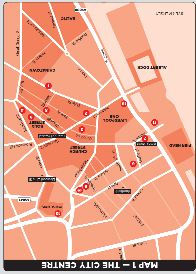
MAP 1 – THE CITY CENTRE

For more in-depth coverage of Liverpool Biennial and Biennial Fringe, visit thedoublenegative.co.uk / #BiennialFringe @thedblngtve / #CultureDiary / #BiennialFringe For more information about Liverpool Biennial, visit biennial.com / @Biennial / #Biennial2016