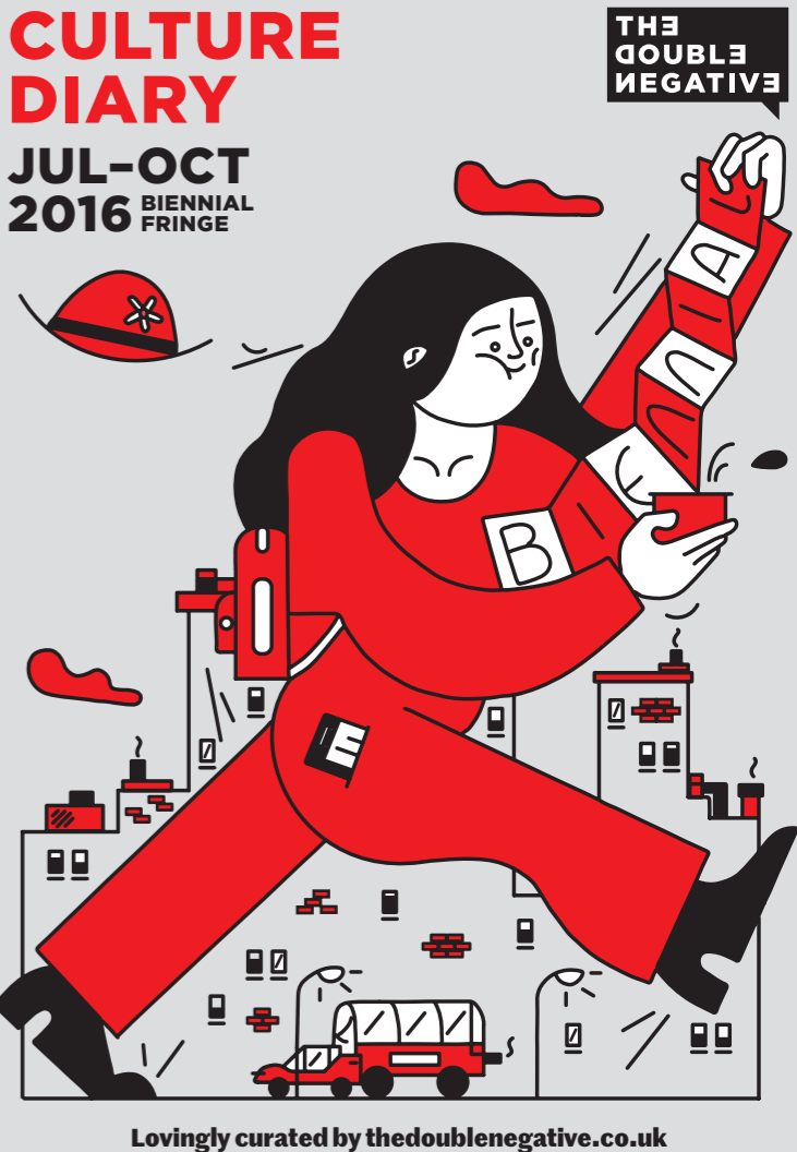
Lovingly curated by thedoublenegative.co.uk

CULTURE DIARY JUL-OCT 2016 BIENNIAL FRINGE